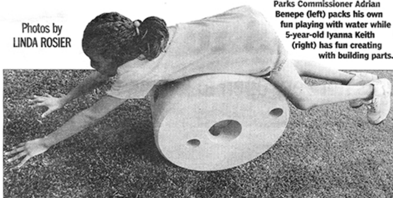
This is how she rolls! Aniyah Beton, 10, rounds out things by creating her own unique mode of transportation. Below, kids from Brownsville Recreation Center Summer Camp decide a little relaxation is in order by creating their own rest area.